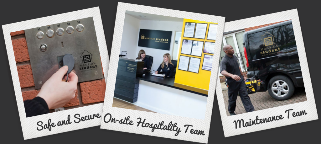
Safe and Secure